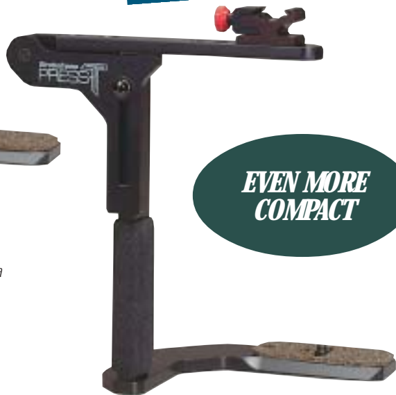
Brackets shown with optional flash mount (Shoe Mount 300-SHO)