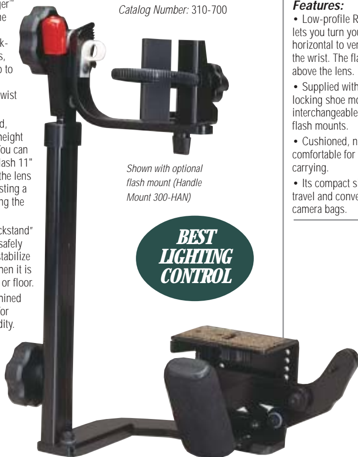
Shown with optional flash mount (Handle Mount 300-HAN)