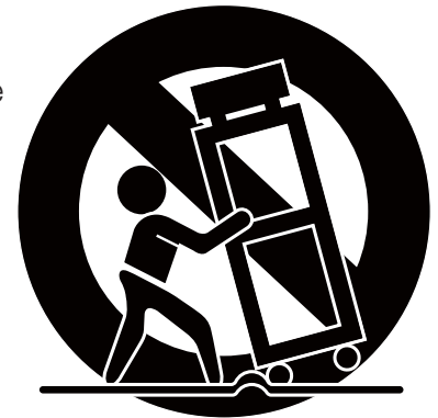
Portable Cart Warning