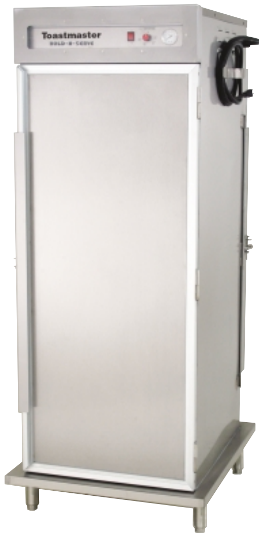
Shown with Optional Prison Package