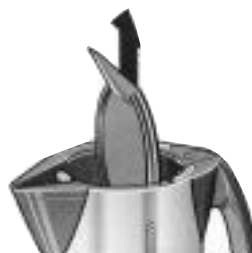
Figure 2 (to remove lid)