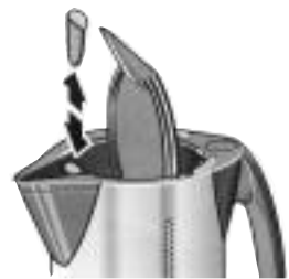
Figure 3 (to remove filter)

Your new Electric Kettle is to be used for heating water only. Do not put any food or beverage into the kettle.