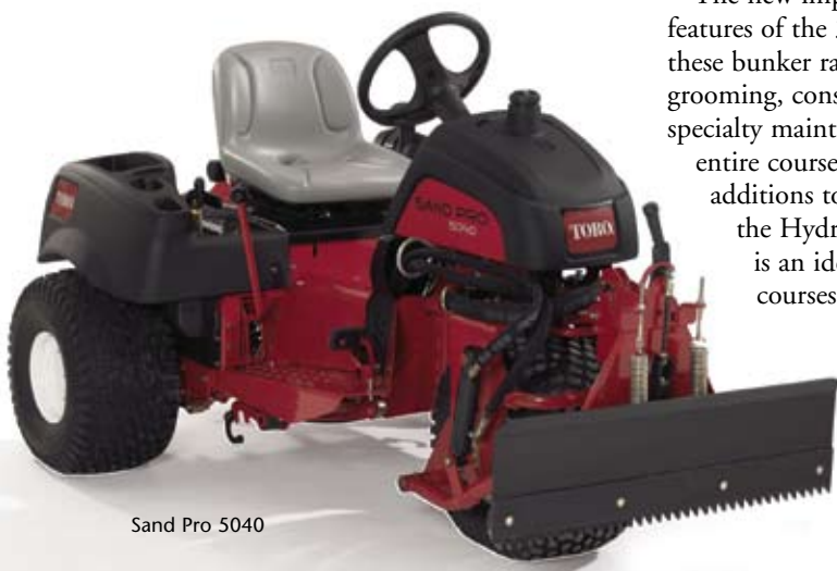
Sand Pro 5040

"I think the new Sand Pro is going to be a very useful tool from our standpoint