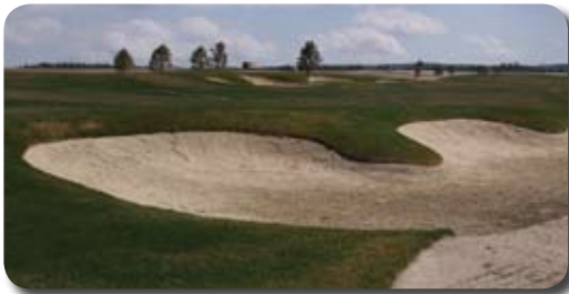
The new DL2000 system provides ideal watering for bunker surrounds.

"With the drip, you can schedule your irrigation to apply water at the rate you need to meet your turf demands and