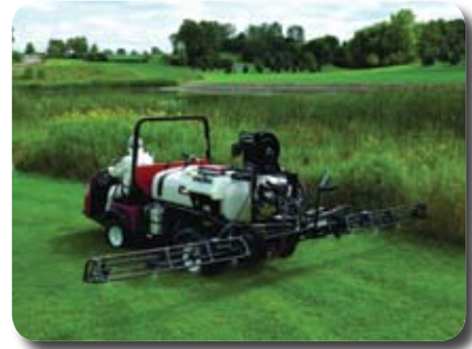
The new Multi Pro Spray Boom is more operator friendly and damage resistant.

The attachment comes with the newly redesigned spray boom (discussed above), a 200-gallon tank and electric boom and rate control valves. The required PTO kit allows the Workman to power the sprayer. Best of all, the system is easy to attach, converting the Workman into a sprayer in less than 30 minutes after initial installation.