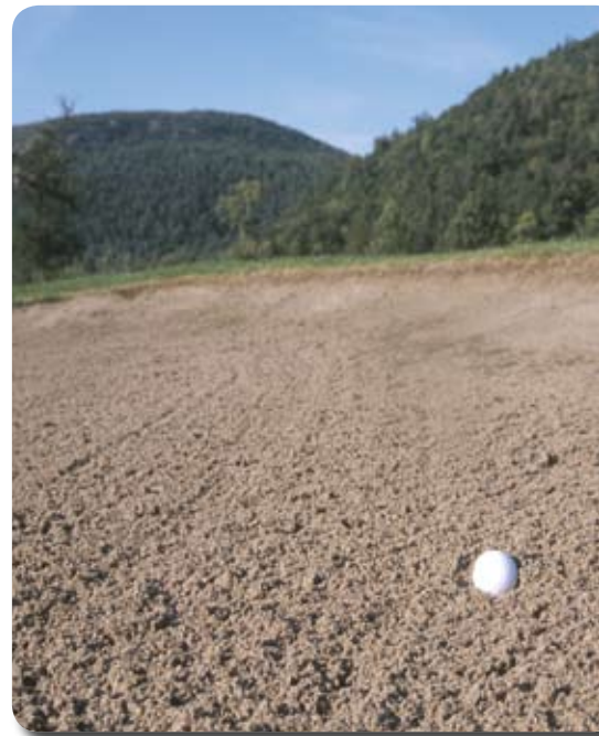
Toro's new Sand Pro models offer superior productivity and result in beautifully groomed bunkers.