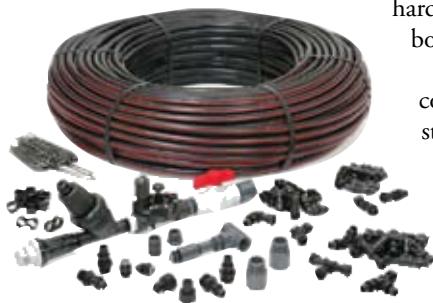
DL2000 System Golf Kit

DL2000 provides many valuable advantages. Agronomically, subsurface drip irrigation enables you to apply precise amounts of water directly to the root zones of your turfgrass and