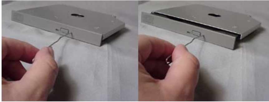
Figure 2.Using Emergency Eject