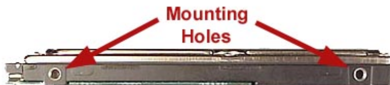
Figure 2.HDD Mounting Holes

Important Note: Disconnect power from your computer system before beginning installation.