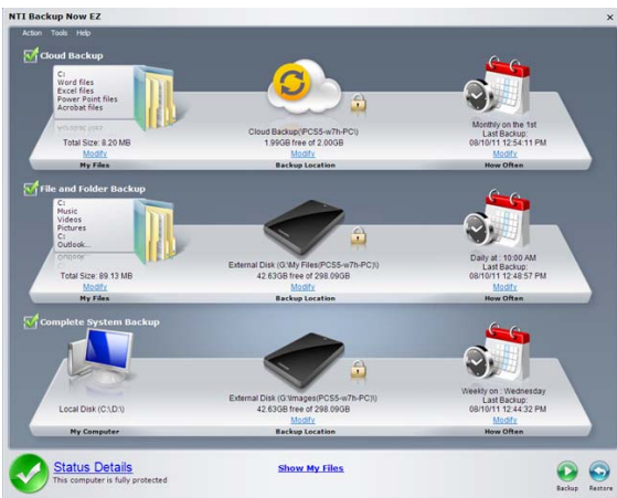
(Sample Image) NTI Backup Now EZ window

Three backup jobs are displayed on the Main screen when Backup Now EZ is launched.