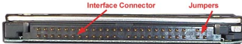
Figure 1. MK1011GAV HDD Rear View - Connectors