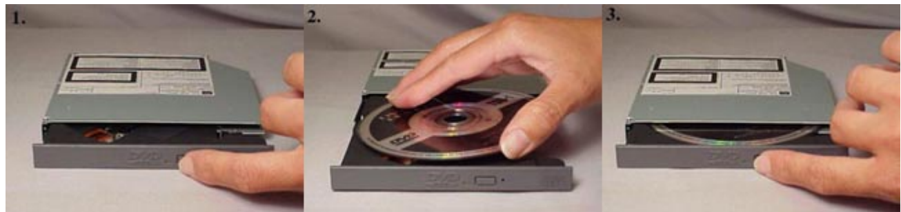
Figure 1. Inserting Disc

To insert a DVD in a DVD-ROM drive that is mounted horizontally, perform the following steps: