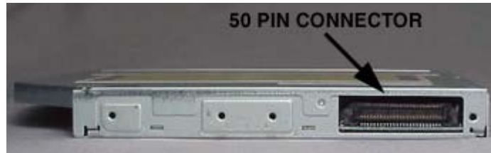
Figure 1. SD-C2712 DVD Writeable Drive Rear Panel – Connector

ATAPI Connector A 50-pin ATAPI interface connector is found at the rear of the SD-C2712 DVD-ROM drive. Connecting cable should use Japan Aviation Electronics Industry Limited KX14-50Series L or equivalent connector.