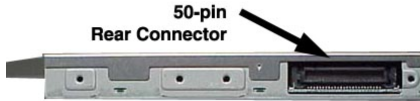
Figure 1. SD-R2002 DVD Writeable Drive Rear Panel – Connector

ATAPI Connector A 50-pin ATAPI interface connector is found at the rear of the SD-R2002 CD-RW/DVD-ROM Combo drive. Connecting cable should use Japan Aviation Electronics Industry Limited KX14-50Series L or equivalent connector.