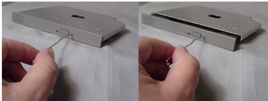
Figure 2.Using Emergency Eject