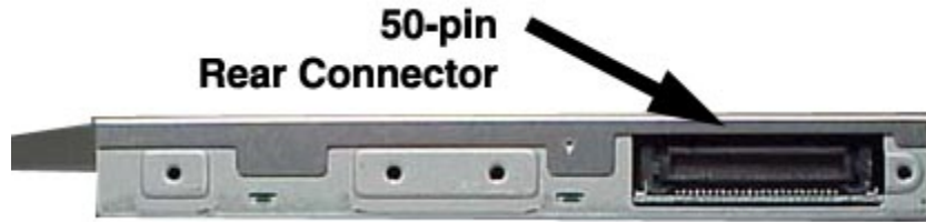
Figure 1. SD-R2212 DVD Writeable Drive Rear Panel – Connector

ATAPI Connector A 50-pin ATAPI interface connector is found at the rear of the SD-R2212 CD-RW/DVD-ROM Combo drive. Connecting cable should use Japan Aviation Electronics Industry Limited KX14-50Series L or equivalent connector.