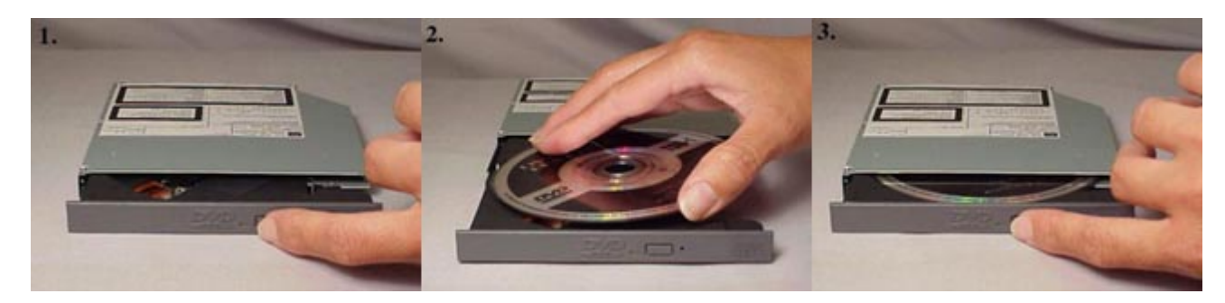
Figure 1.Inserting Disc

To insert a DVD in a DVD-ROM drive that is mounted horizontally, perform the following steps: