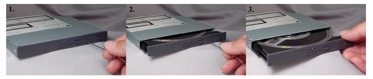
Figure 2.Using Emergency Eject