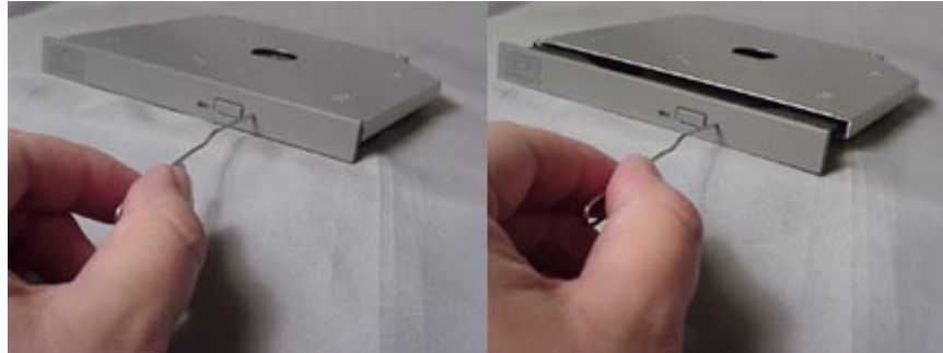
Figure 2.Using Emergency Eject