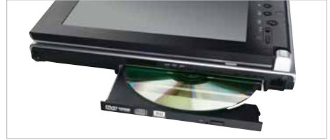
Optical disk drive: featuring an Optical Drive Auto Lock to prevent accidental opening of DVD bay