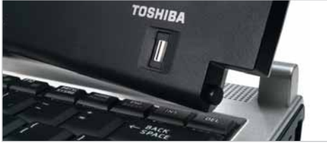
Fingerprint Reader: secure and convenient single touch sign-on