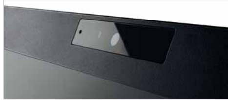
Integrated webcam and microphone: voice and video conferencing on the go*