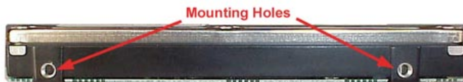
Figure 2.HDD Mounting Holes

Important Note: Disconnect power from your computer system before beginning installation.