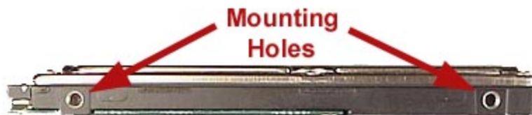
Figure 2.HDD Mounting Holes

Important Note: Disconnect power from your computer system before beginning installation.