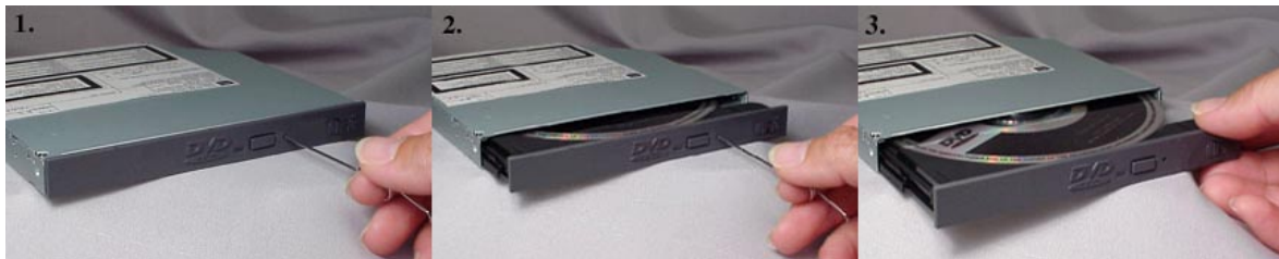
Figure 2.Using Emergency Eject