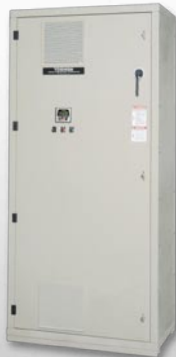
H7 Assembly Unit