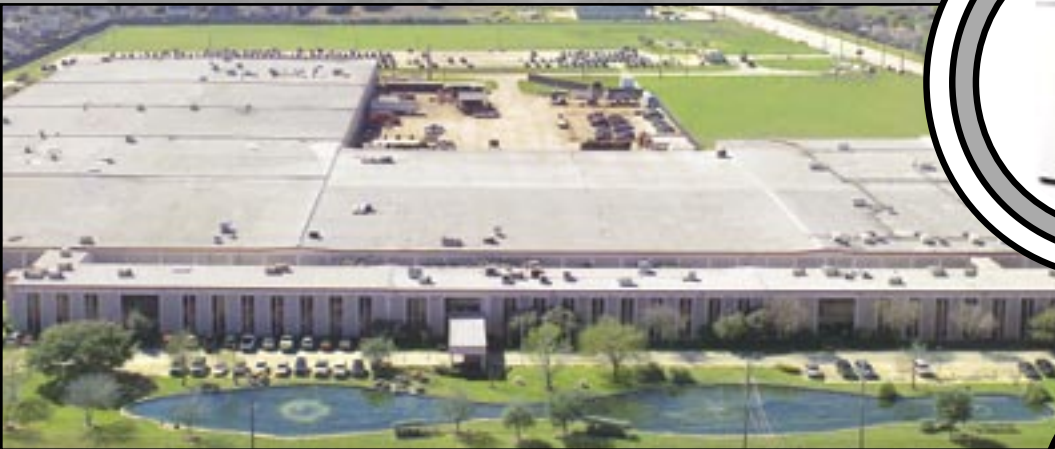
North America Headquarters & Manufacturing Facilities (Houston, TX)