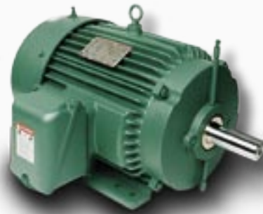
Integrated Toshiba Motor/Drive Packages

Speed search detects the direction and rotational speed of a free-wheeling motor. By matching the ASD output to the direction and speed of the motor, the H7 smoothly restarts the motor and accelerates to the commanded speed. This feature allows for power source switching between commercial power and drive operation without the added expense of brakes, timers or other methods of stopping the motor.