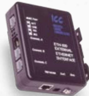
(below) Ethernet TCP/IP Communications Module