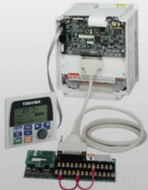
Remote-Mount Interface and Terminal Strip

The removable control terminal strip is available in dry contact, TTL or 120 VAC configurations and may be optionally DIN Rail mounted. The operator interface can be easily mounted remotely and configured for NEMA4/NEMA12 environments.