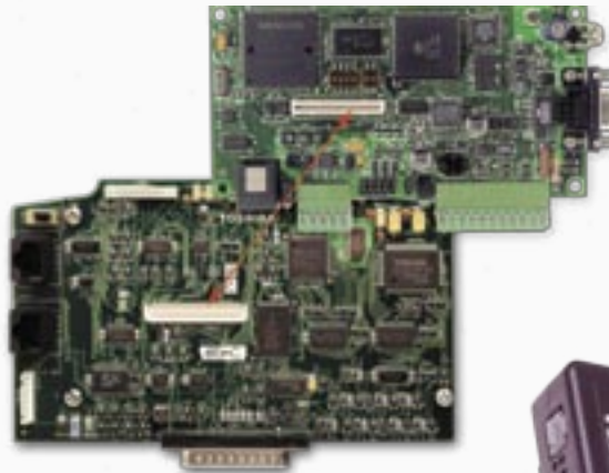
(left) H7 Control Board with Internal Stackable Communication Card

In today's fast-paced manufacturing world, coordinated systems require communications from drive-to-drive or drive-to-control systems. Toshiba's H7 comes standard with RS232/485 and TTL communications ports. In addition to the standard communications features, Toshiba offers a number of popular industrial communication protocol options including: Modbus RTU, Modbus Plus, Ethernet TCP/IP, Ethernet IP, Profibus DP, DeviceNet and Johnson Controls Metasys N2.