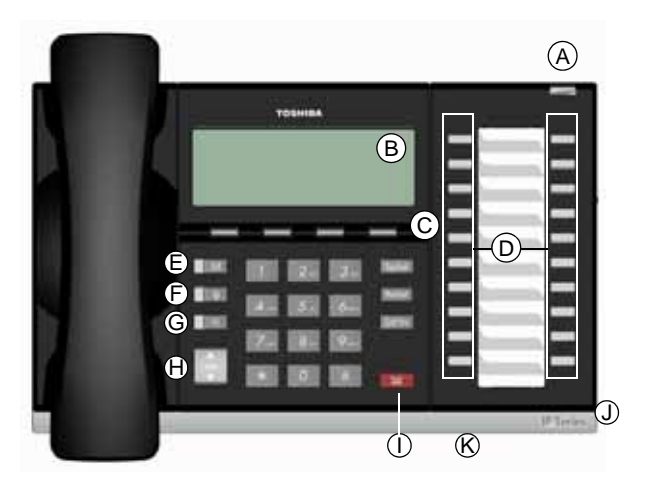
20 Programmable Feature Buttons 4-Line LCD