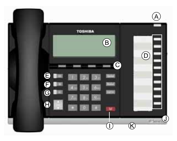
10 Programmable Feature Buttons 4-Line LCD