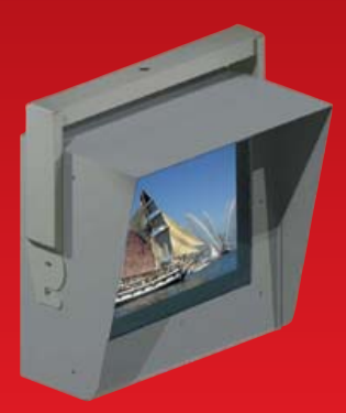
Shown with ceiling mount option # 2: yoke bracket