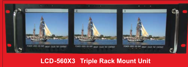
LCD-560X3 Triple Rack Mount Unit