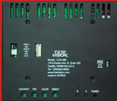
LCD-560 Back View