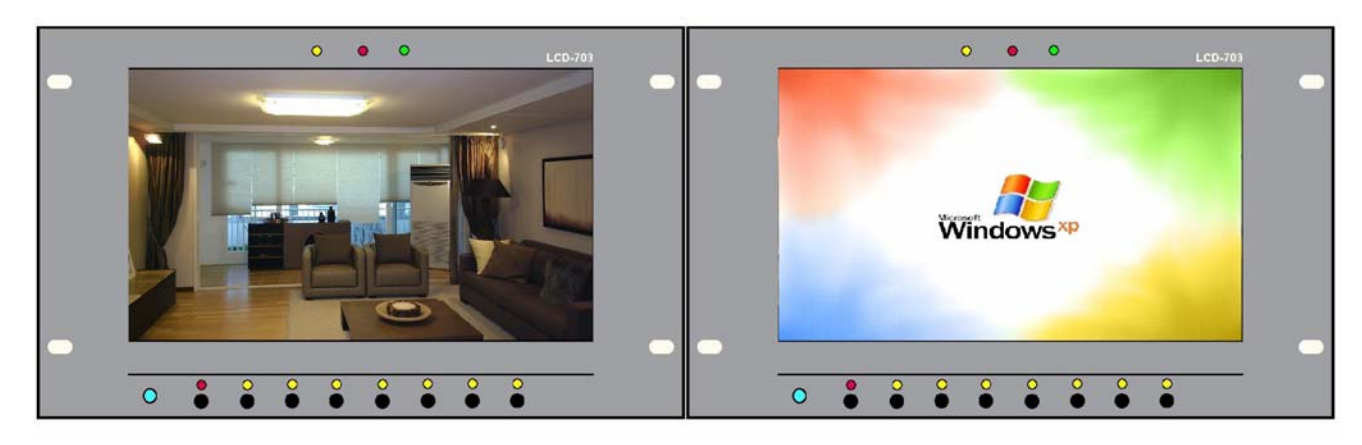
LCD-703HD1 (single unit) LCD-703HD2 (two units)