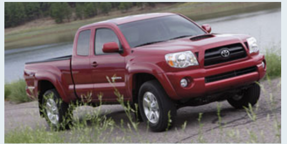
PreRunner Access Cab V6 shown in Impulse Red Pearl with available TRD Sport Package