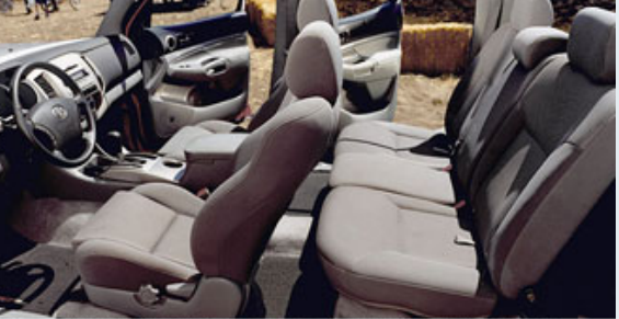
Tacoma Double Cab interior shown in Graphite with available TRD Off-Road Package