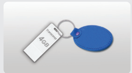
Easily attaches to mobile phones or keychains