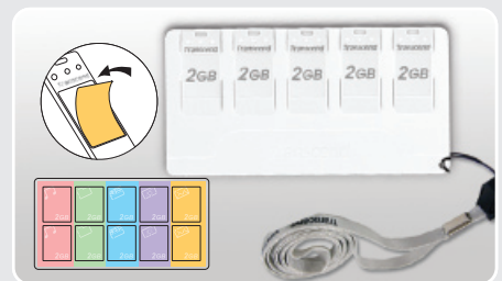
5-drive slim carrying case and color-coded labels