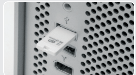
Plugs directly into USB port