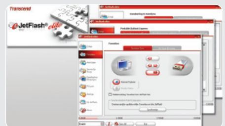
Powerful software tools