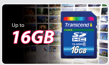
Up to 16GB capacity