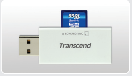
Card reader included (16GB SDHC package)