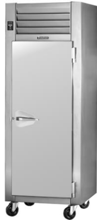
Model RLT132WUT-FHS (shown with optional casters)