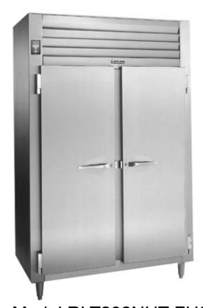
Model RLT232NUT-FHS (shown with standard left/right hinging)