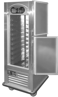
Half Length Door Model RAC37-HHS