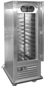
Full Length Door Model RAC37-FHS