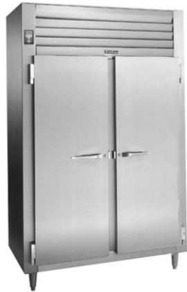
Model RHT232NUT-FHS (shown with standard left/right hinging)