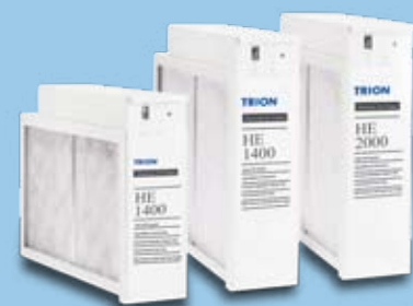
HE Plus 1400

Trion® electronic air cleaners easily attach directly to your home's heating and cooling system ductwork, passing recirculated air through the air cleaner. A permanent, washable, aluminum mesh pre-filter captures large particles in the air pulled in by the furnace blower. High-voltage ionization within the Trion® exclusive Forever Filter® purifying cell then attracts and captures the particles on alternately charged aluminum plates, filtering up to 95% of particles as minute as 0.1 micron and preventing harmful irritants from being constantly recirculated.