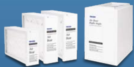
Media Air Cleaners

To learn more about Trion® residential products, contact your local Trion® representative or you can visit us on the web at www.TRIONINC.com