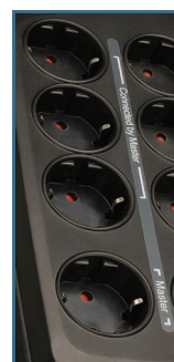
Energy-Saving Master/Subordinate Outlets

Models TLP82MASD and TLP82MASF include an energy-saving feature that allows one "Master" outlet to control power to three "Subordinate" outlets. When a computer connected to the "Master" outlet is switched on or off, the "Subordinate" outlets are also switched on or off. This feature turns off idle peripherals (such as printers, monitors and scanners) that aren't needed when your computer is off. Because these "phantom loads" continue to consume electricity while connected to live outlets, turning off the outlets prevents them from wasting energy.