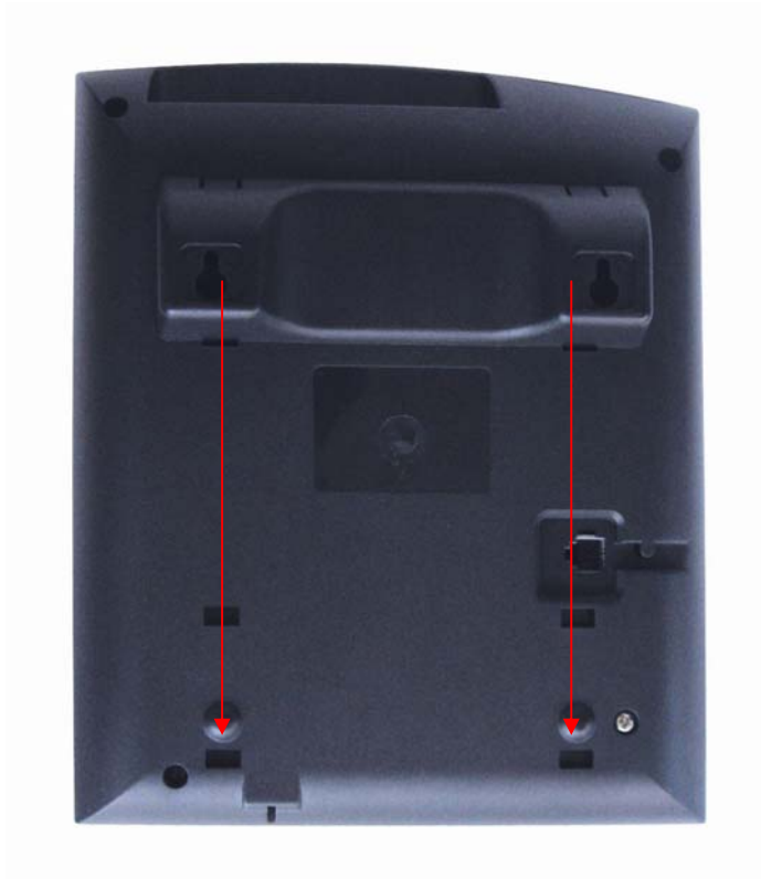
Figure 2: Attach the base stand to the bottom part of the phone to tilt is backwards.

To position the phone on the wall, place a fixed hanger on the wall, hang the back of the phone on the fixed hanger.