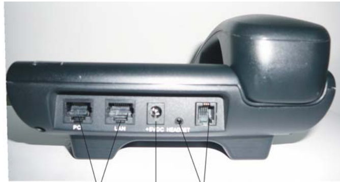
Rj45 Jack Power Jack Headset Jack