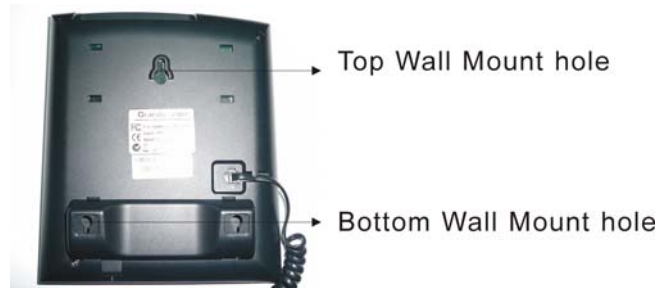
Figure 3: Location of the fixed hanger on GXP280

To use the handset, pull out the tab (extension downward) from the handset cradle, rotate the tab and plug it back into the slot with the extension up to hold the handset.