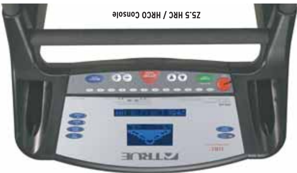
Z5.5 HRC / HRC0 Console