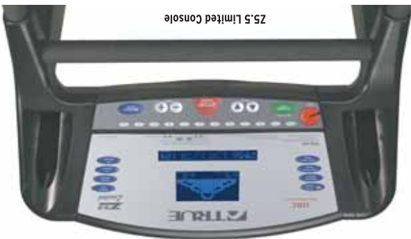
Z5.5 Limited Console

©2005, TRUE FITNESS TECHNOLOGY, INC. BROCH061061V1