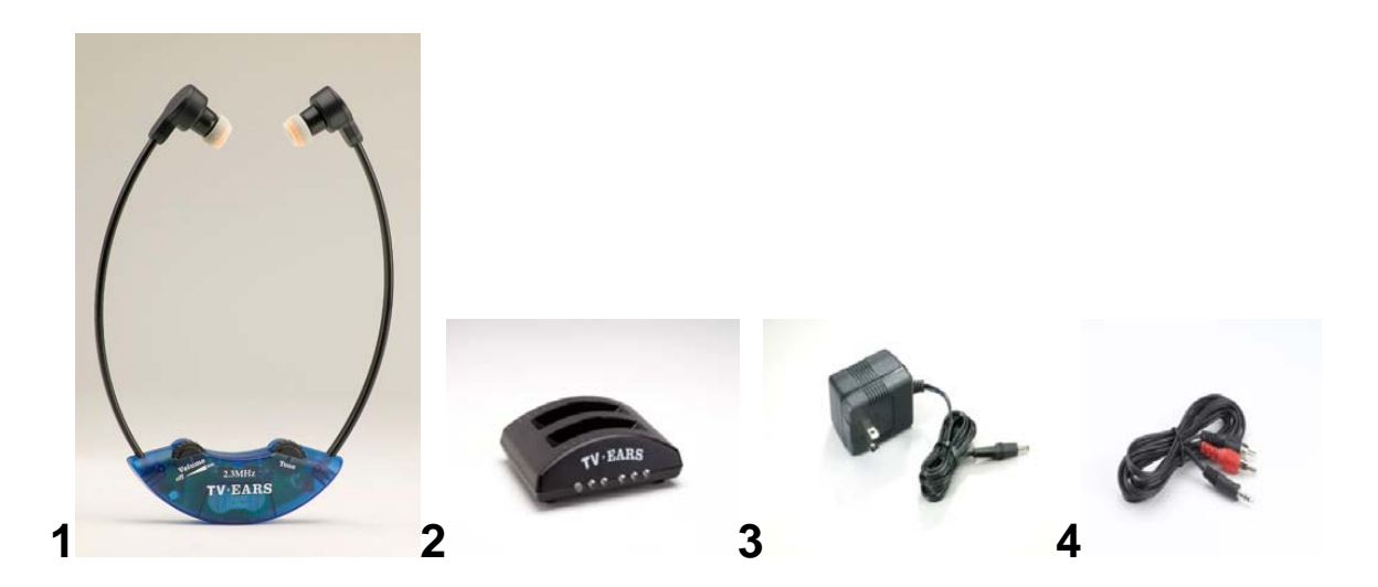
Step 1 - Contents

Remove items from box (1) Headset, (2) Transmitter, (3) A/C Adapter, (4) Audio Cord.