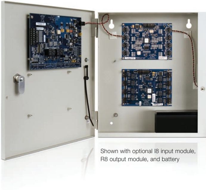
Shown with optional I8 input module, R8 output module, and battery