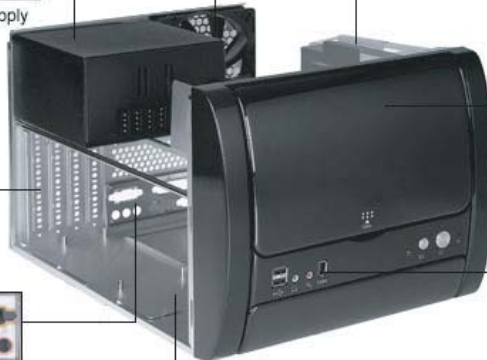
5.25" Drive Bays