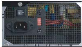
XVS Series 600-Watt Power Supply