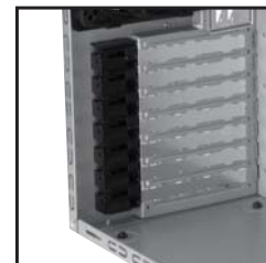
Tool-less PCI Slots