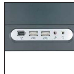
Top Access USB, Firewire, & Audio