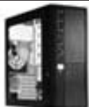
Tool-less Drive System