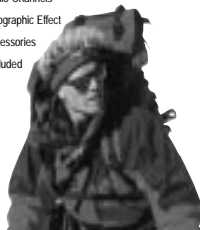
*Range may vary depending on environmental and/or topographical conditions.

Congratulations on your purchase of the Uniden GMRS480 (General Mobile Radio Service) radio. This product is a lightweight, palm-sized radio. Use it at sporting events to stay in contact with family and friends, hiking, skiing, outdoors, or in a neighborhood watch for vital communication. This compact, state-of-the-art device is equipped with many features.