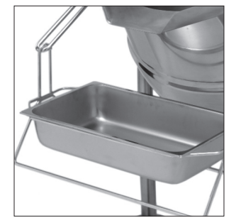
Kettle pan carrier

This simple pan support attaches easily to the front of the kettle and holds a standard steamer pan at the pouring lip for easy filling. The steamer pan stays level regardless of the kettle pouring angle, and is easily removed for cleaning or storage. The pan carrier will hold 2/12-6" deep and half-size (12x10") pans.