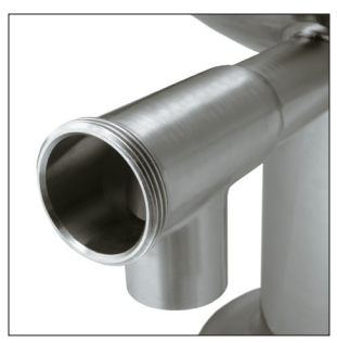
Draw-off valve for easy food transfer

Draw-off valves make transfer of thick and chunky product, draining off cooking water and kettle cleaning easier. They are standard on stationary floor models and are available for all utility floor model kettles to provide additional product transfer options.