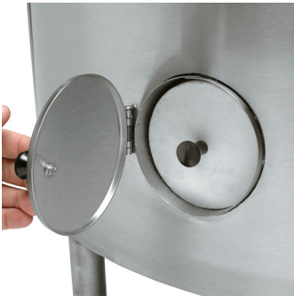
Burner flame view access