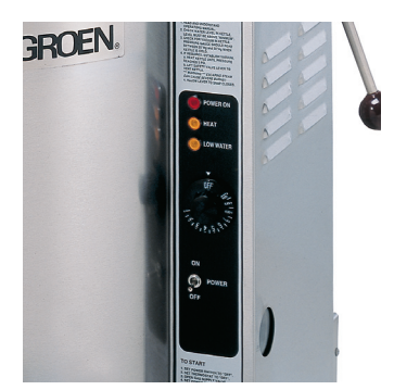
Easy to use control panel