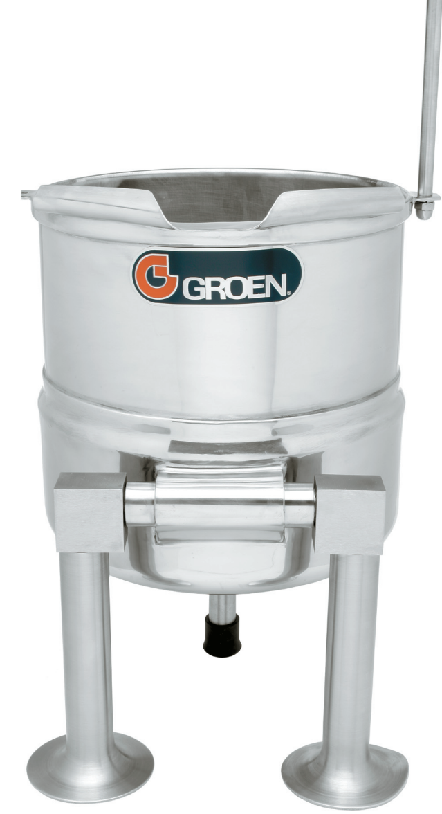
TDC/3-20 Model Shown