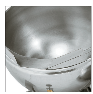
Kettle pouring lip

Strainers are available for the pouring lip of tilt model kettles to strain ingredients past vegetables or seafood. They are easily attached and removed for cleaning and to allow full flow of product when not required.