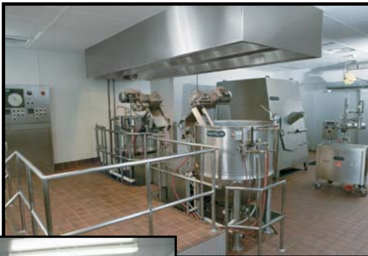
CapKold kitchen (from left to right, shown above) - kettle control panel, (2) kettles, tumble chiller and pump-fill station