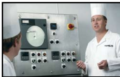
Kettle control panel training