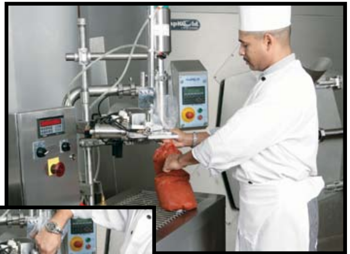
Transferring kettle foods to flexible plastic casings

At the completion of a cooking cycle, the Pump-fill Station draws product from the kettle, measures a pre-set volume, and fills a flexible plastic casing. The operator uses a station-mounted clipper to seal, attach a label, and trim the casing in one fluid motion. One employee can typically empty and package the entire contents of a 200-gallon (750-liter) kettle in 15-20 minutes. A Pump-fill Station can be shared by two or more kettles.