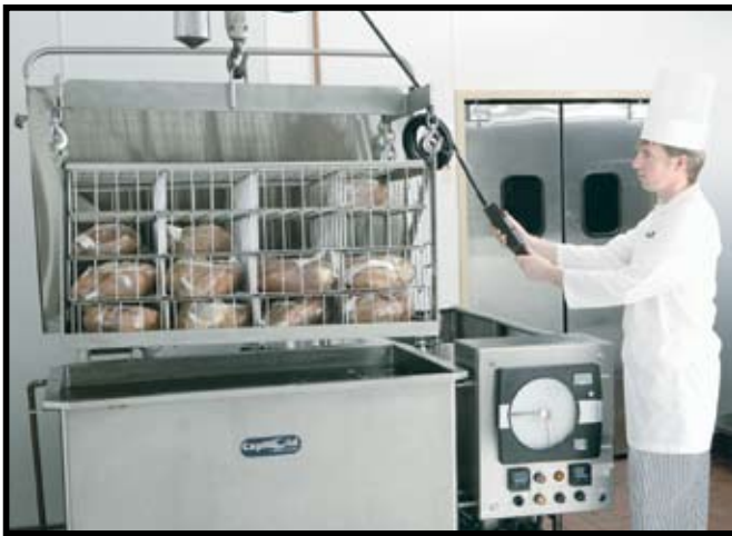
Loading and unloading food product with a push of a button

Water bath slow cooking can be done overnight, unattended. An integral control system monitors both cooking and chilling and provides a time/temperature production record for HACCP and quality assurance.