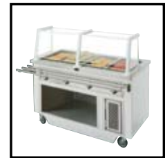
Randell RanServe hot food tables have integral heaters and are NSF listed