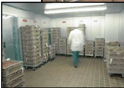
Refrigerated food bank for storage up to 45 days