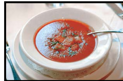
Heated, plated and ready to eat