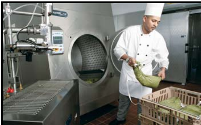
Unloading chilled casings from tumble chiller to food bank storage