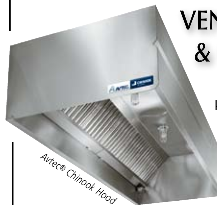
Avtec® Chinook Hood