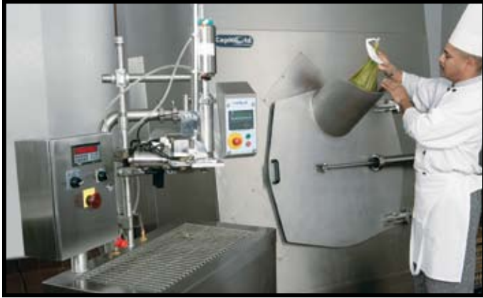
Loading filled casings directly into the tumble chiller