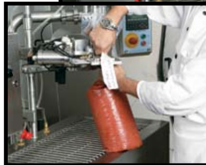
Station-mounted clipper for sealing, attaching label and trimming casing