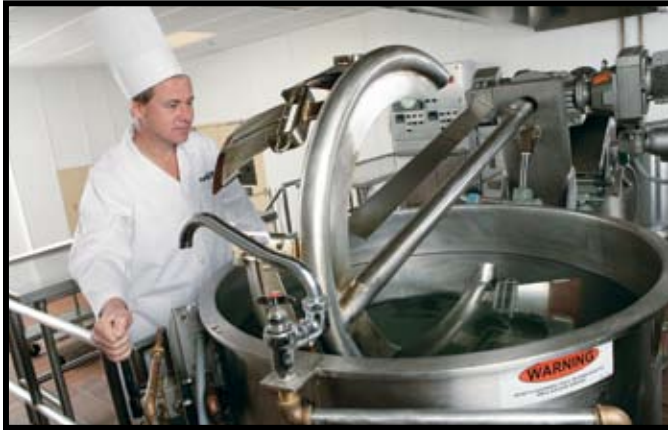
Proven kettle agitator design