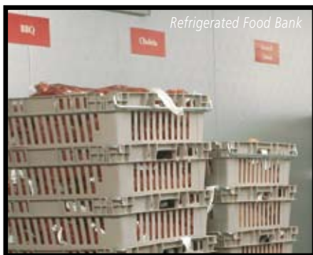
Refrigerated Food Bank