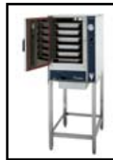
Groen steamers are an excellent way to reheat food in casings or steam pans

CapKold foods are ideal for pre-plating as part of a tray makeup and delivery system. They can be used in combination with freshly prepared foods and foods which have been blast-chilled. Randell offers a line of blast chillers as well as standard and customized hot and cold food tables for serving applications.