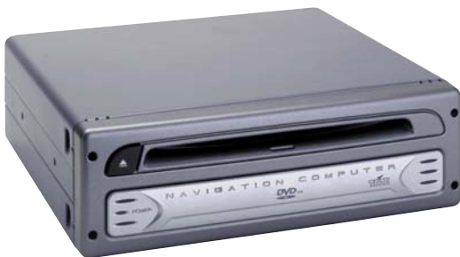
*Mounting sleeve not included