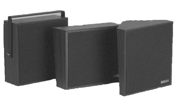
V-1063A, V-1065A, V-1067A