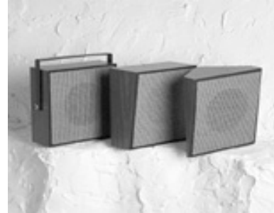
V-1062B, V-1064B, V-1066B