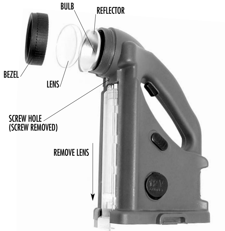
FIGURE 6 - LANTERN LIGHT PARTS REPLACEMENT