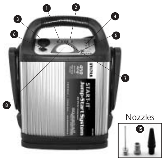
FIGURE 1A (Front View)