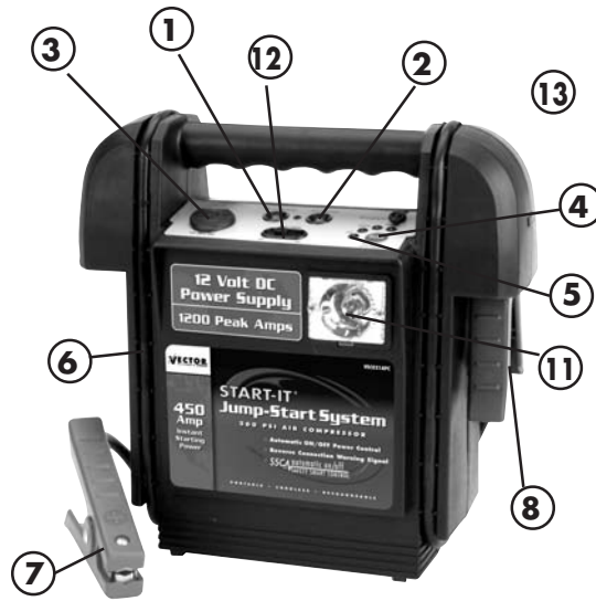
FIGURE 1A (FRONT VIEW)