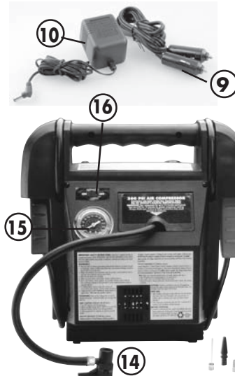
FIGURE 1B (REAR VIEW)