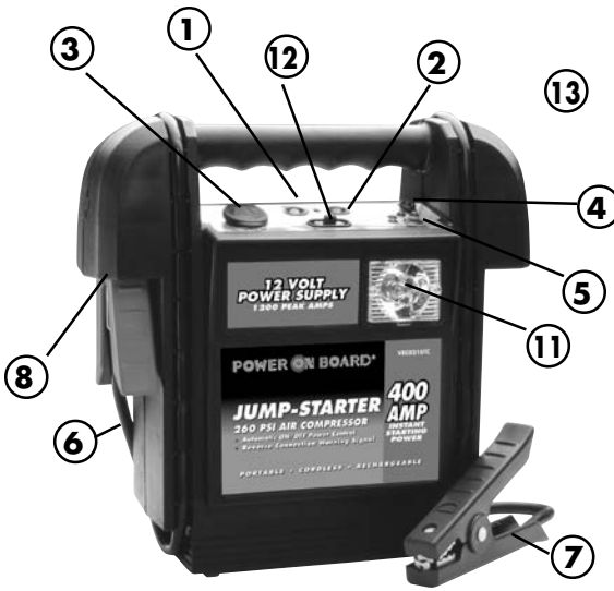
FIGURE 1A (FRONT VIEW)