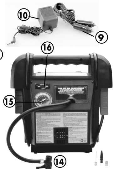
FIGURE 1B (REAR VIEW)